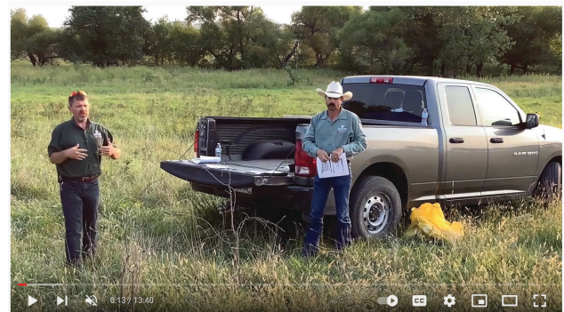
Tailgate Talk 2022 - Video 1